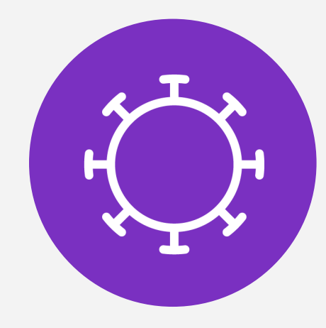
3. Cultivate innovation and digital leadership within your organization