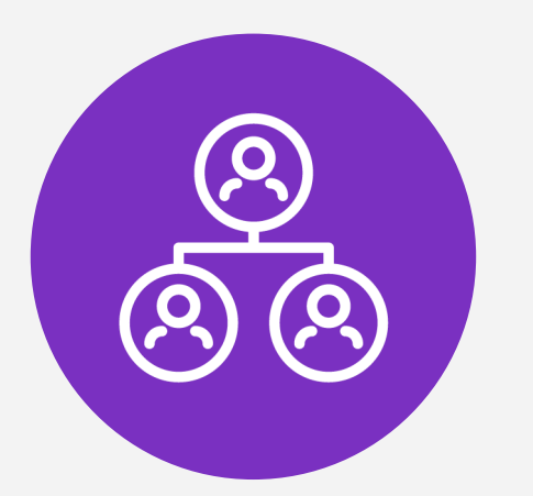
1. Build strategic partnerships that leverage innovations from across sectors